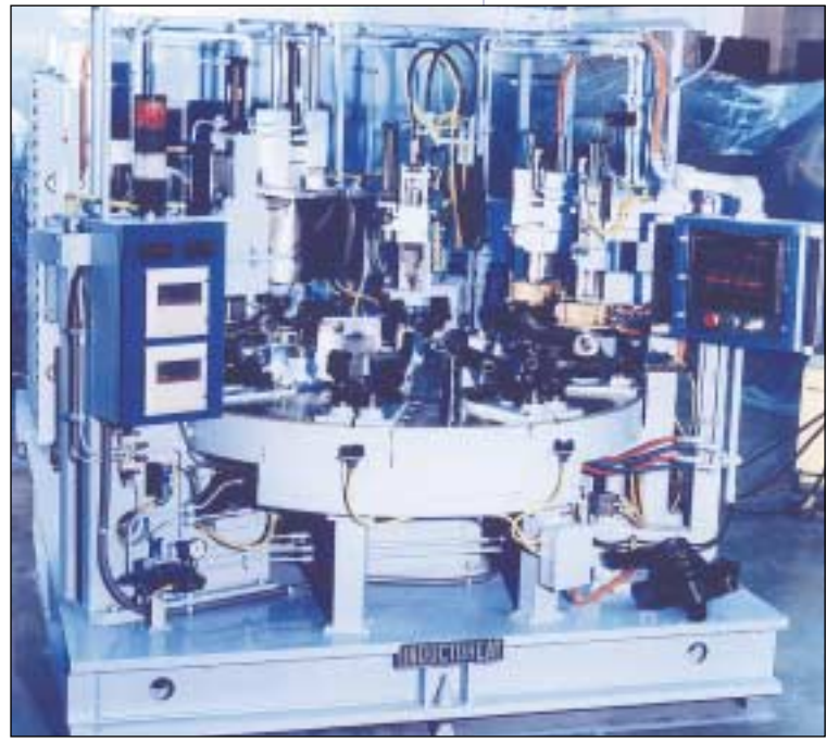
Fig. 1 — Eight-station shrink fitting machine is used to assemble truck steering knuckles. The Inductoheat system produces 30 knuckles per hour.

Contact Dr. Rudnev at Inductoheat Group 32251 North Avis Drive Madison Heights, MI 48071 tel: 248/585-9393; fax: 248/589-1062 e-mail: rudnev@inductoheat.com Web: www.inductoheat.com