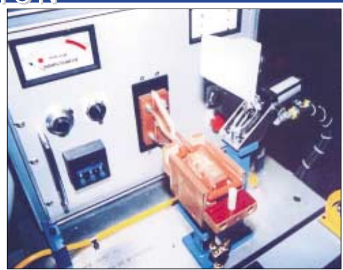
Fig. 2 — Preheat and final heat stations of the system for shrink-fit assembly of truck steering knuckles (see Fig. 1). A line-frequency source powers the C-core inductors.