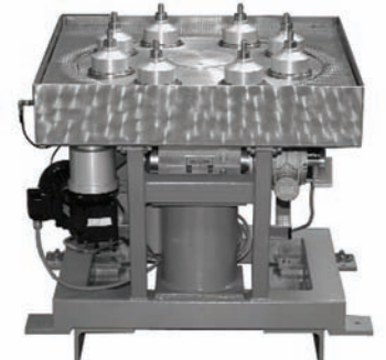
Indexing table module

Specifications are subject to change without notice.