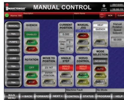
Inverter matching assistance