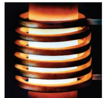
High voltage multi-turn coil