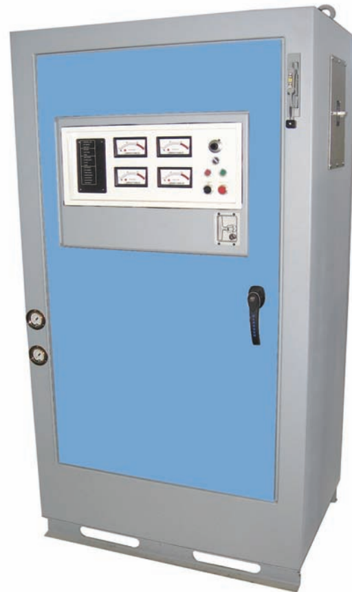
SP12 150 kW / 30 kHz unit