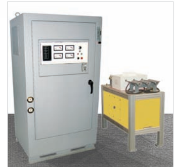
100 kW / 10 kHz bar end heater