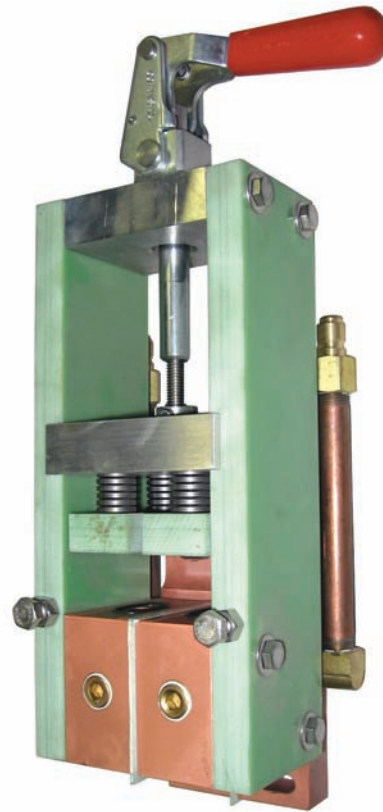
Insta-Change coil adapter