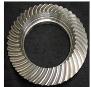
Ring gear shrink fitting