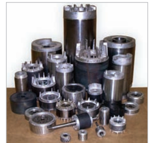
Various sizes of rotors